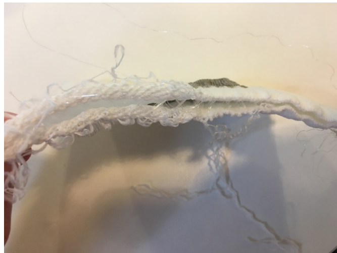
Figure 3. Close up of the knitted structure

In figure 3 a cross section of the swatch is visible. By using what is called a spacer fabric knitting a certain thickness of the fabric is obtained. This enables the incorporation of pockets as mentioned above and the integration of different materials to be produced.